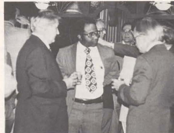
Quarter Century Club members swap stories about their days with GE.