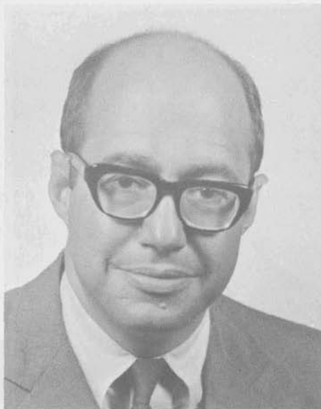
Legal Counsel Information Services Division