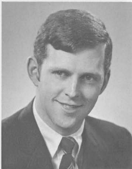
Senior Specialist-Banking and Finance Market Information Service Department