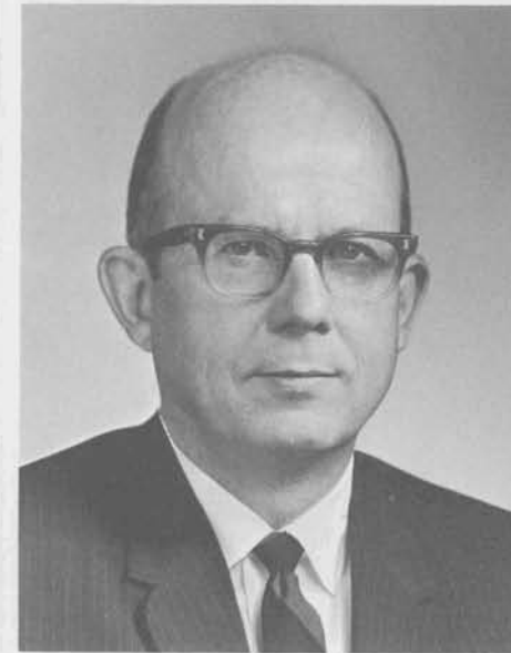
Manager-Marketing Information Service Department