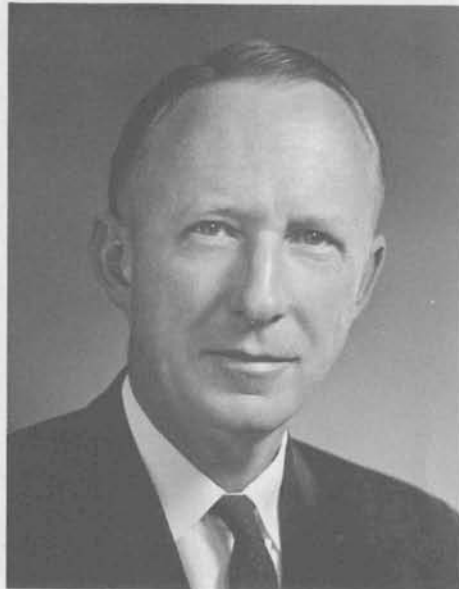
General Manager Information Service Department