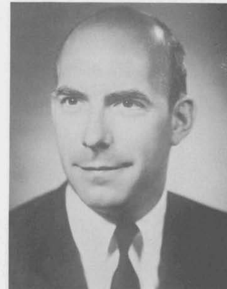
Manager-National Marketing Information Service Department