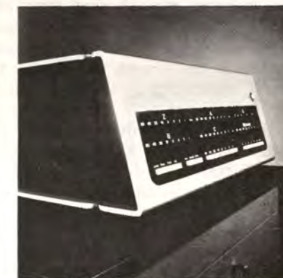
Wang 3300 Basic