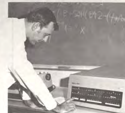
SOMETHING TO FILL THE GAP the Wang 3300 central processor

The BASIC language was chosen after Wang market research showed it to be the most popular conversational time-sharing language. Included in the software package are: an immediate