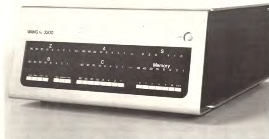
Time-sharer. Computer for in-house systems uses Basic language for scientific, engineering, and commercial applications.

The 3300 system is designed to sell at a price low enough to fit