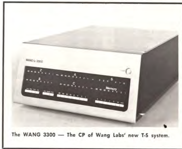
The WANG 3300 — The CP of Wang Labs' new T-S system.

($1,400); and the BASIC software package which includes a one-time set-up and initialization fee ($1,500). Total: $17,550. Assuming individual terminal users are content with 1400-byte partitions (partition size is determined at set-up time), a 4-user Selectric/cassette system would cost $25,650. Two- and four-user TTY systems are priced at $15,250 and $21,250. Goodies include an acoustic coupler ($795) for use with the TTYs, and still-to-be-priced 65K and 1/2-megabyte disks.