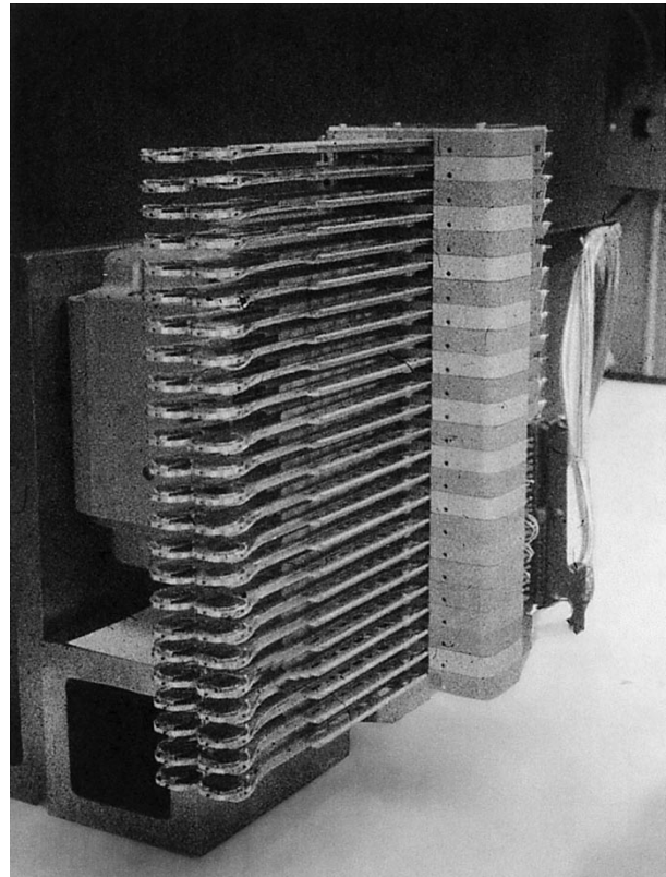
Fig. 2. ADF head-arm assembly module.

Even before the RAMAC was announced in 1956, a decision was made in 1955 to start on the next generation disk drive, a project named ADF, which had the objectives of obtaining ten times the capacity and 1/10 the access time of the RAMAC. These advanced performance targets for the ADF were essential to expand data processing into major new applications being identified. The first of these was the American Airlines Airline Reservations System (Sabre), which depended on a geographically dispersed real time online transaction processing capability. In addition to a commercial version having a single read-write channel for each disk module, a unit with parallel data transfer was crucial to Stretch, the new supercomputer which IBM was counting upon to gain the lead in high-end data processing. The delivery date of the Stretch drive preceded that of commercial version, causing a compression of product