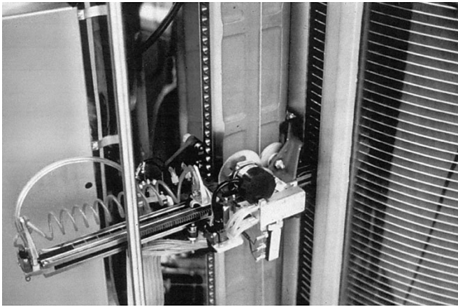
Fig. 1. RAMAC 350 disk-drive access mechanism.

was an ingeniously designed pressurized air-bearing slider. The cost and complexity of this feature led to the choice of an actuator-arm assembly with a head pair—one for the upper surface and one for the lower surface of a disk. Thus, the positioning mechanism transported the head pair up and down the stack to the desired disk and then in and out to a specified track [2]. The magnetic head involved a unique design having very narrow pole tips to maximize density with the head-to-disk spacing of 25\ \mu\text{m} . Fifty 61-cm (24-in) aluminum disks coated with iron oxide paint were needed to provide the capacity required for the targeted transaction processing applications. The drive, storing 5 MB at 100 bits/in and 20 tracks/in, had to be able to record or retrieve records spread over 240 square feet of surface area in less than a second (Fig. 1). At first, there was a great deal of skepticism among the engineers that such a mechanical device would ever work [3].