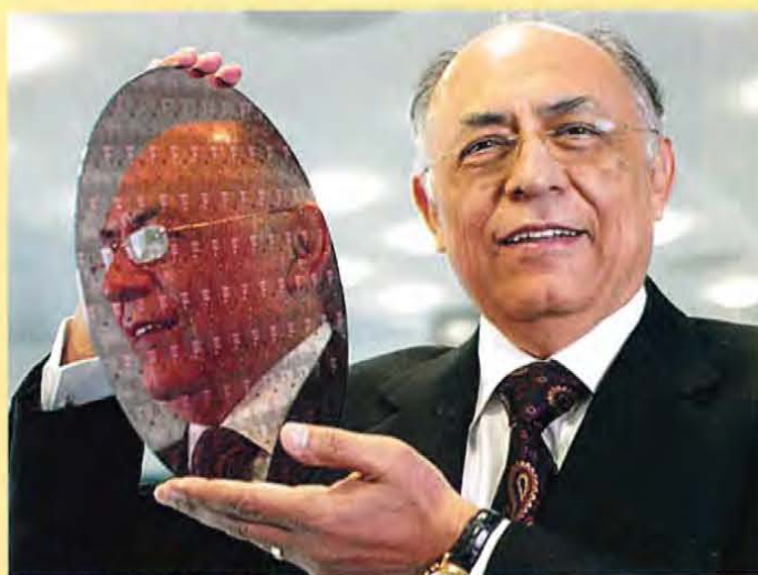
Ruiz, CEO of AMD, holds a 300-millimeter (12-inch) wafer containing 64-bit computer chips, one of the first products produced in 2004 by a new AMD factory just opened in Dresden, Germany.