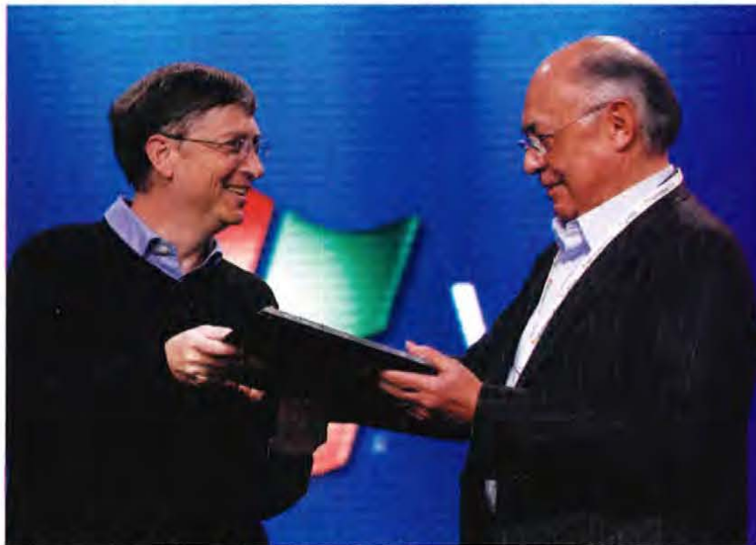
Hector Ruiz, right, then CEO of AMD, presents Microsoft CEO Bill Gates with an AMD-based laptop running Windows Vista at the launch of Vista and Microsoft Office 2007 in New York City in January 2007.

Ruiz couldn’t have received an engineering Ph.D. at a worse time. It was 1973, the depths of the aerospace recession after President Richard M. Nixon had