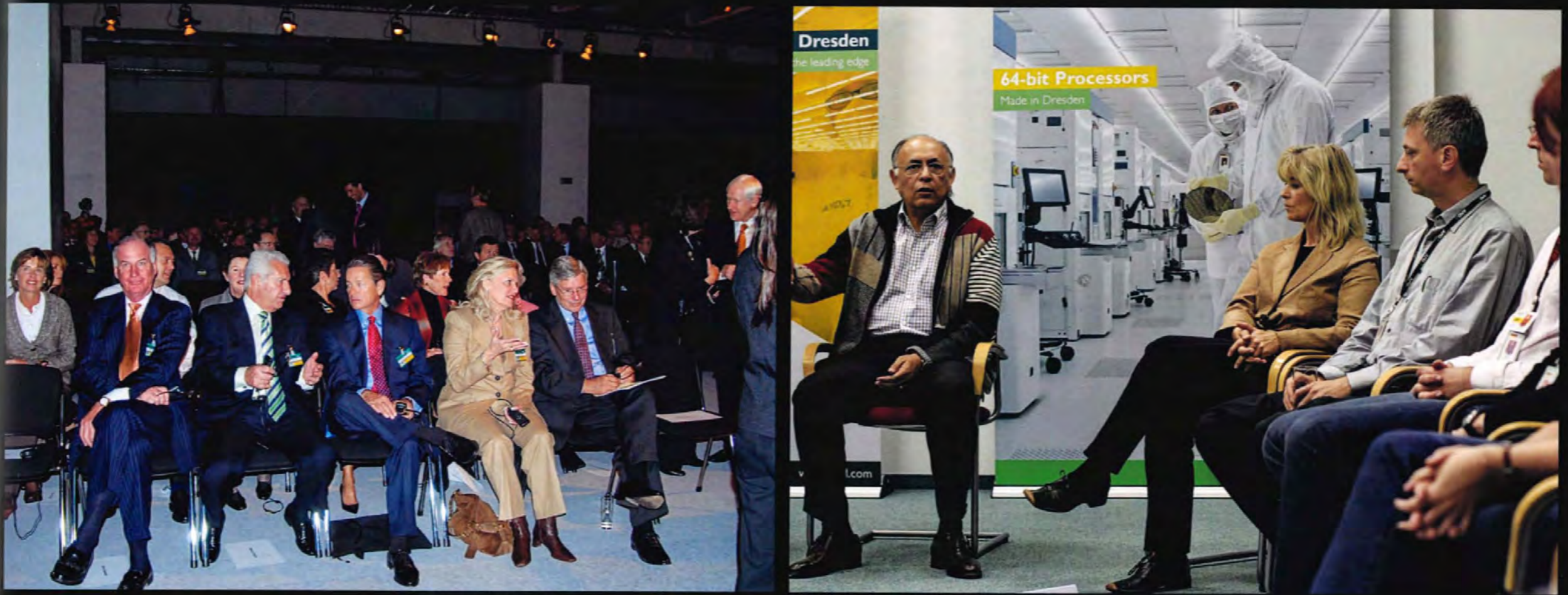
Dresden - October 2006