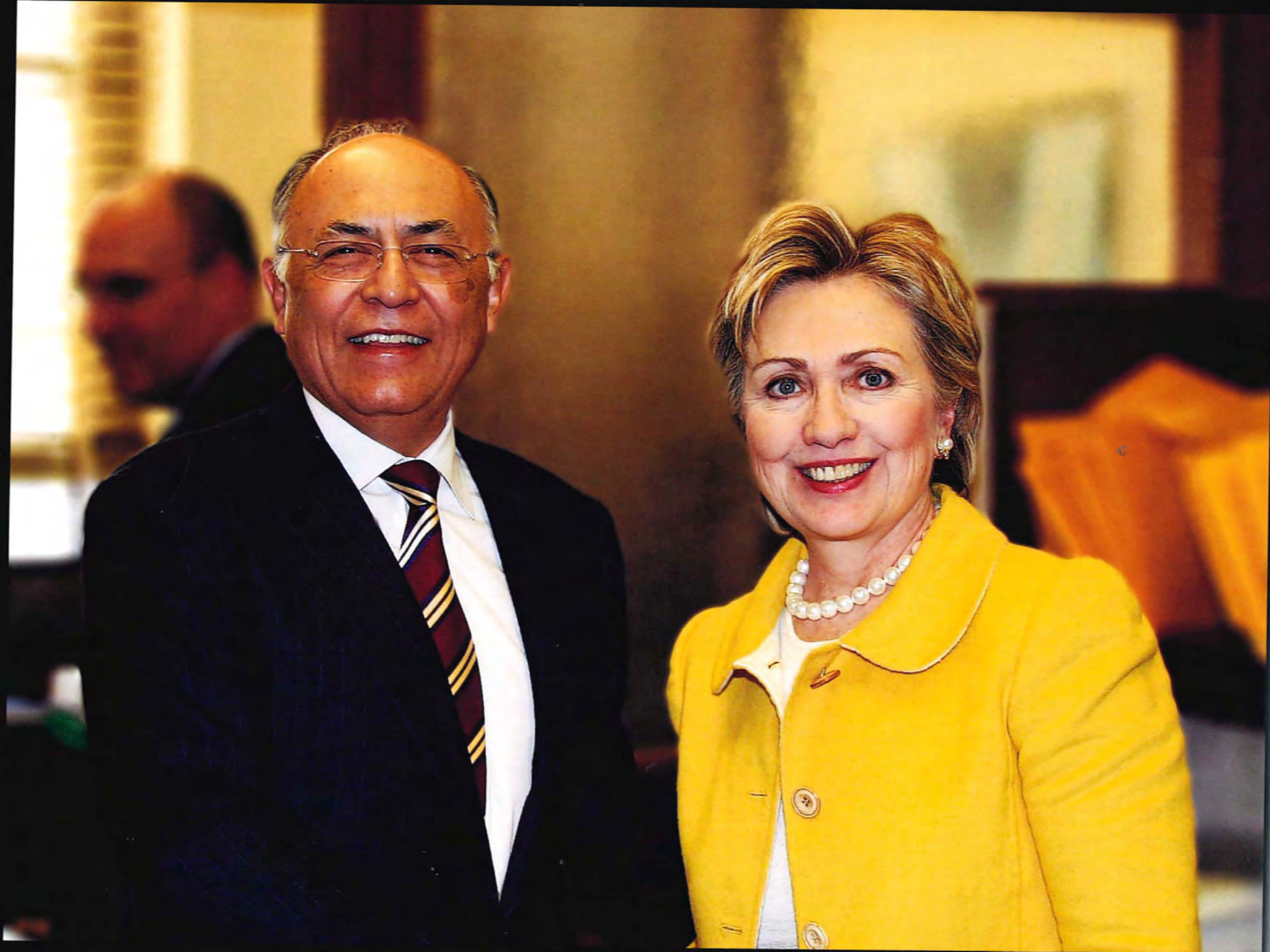
Dr. Hector Ruiz and Senator Hillary Clinton - January 2007