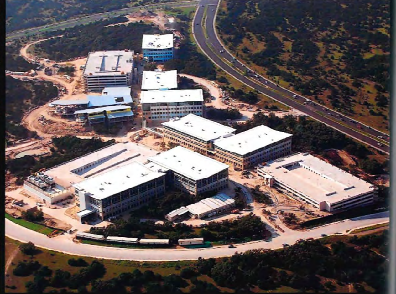
AMD Lone Star Campus