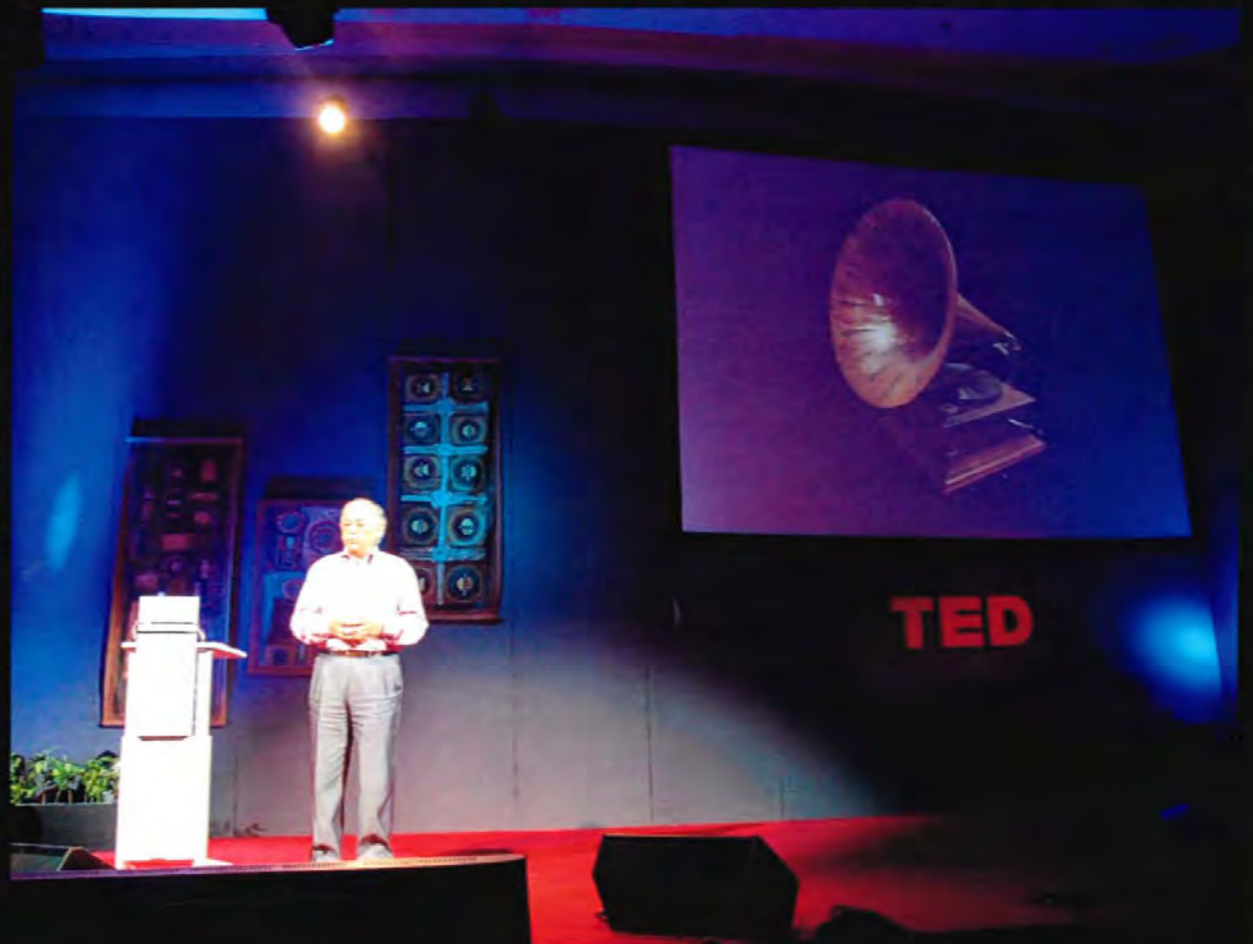
East Africa - 2007