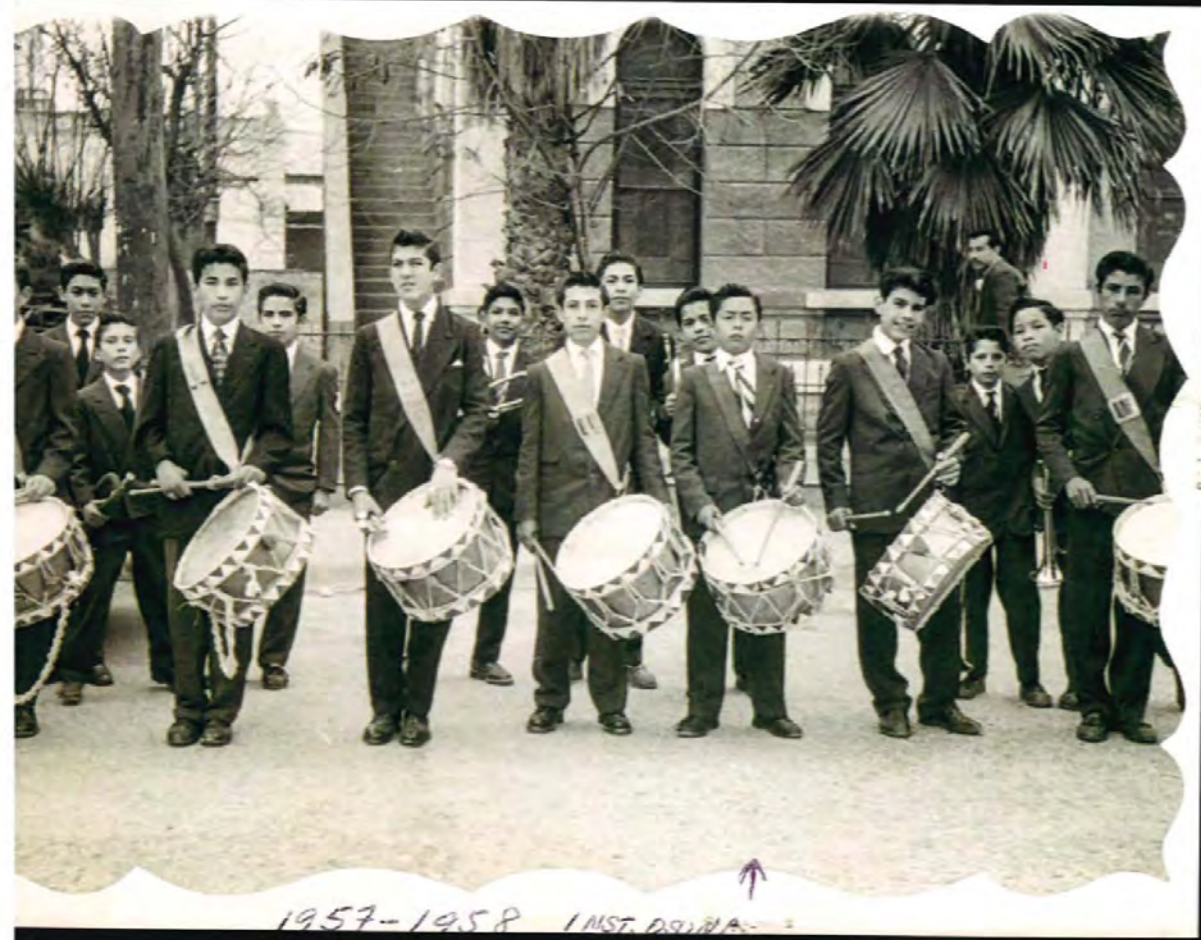
1957-1958 INSTR. DRUMMA