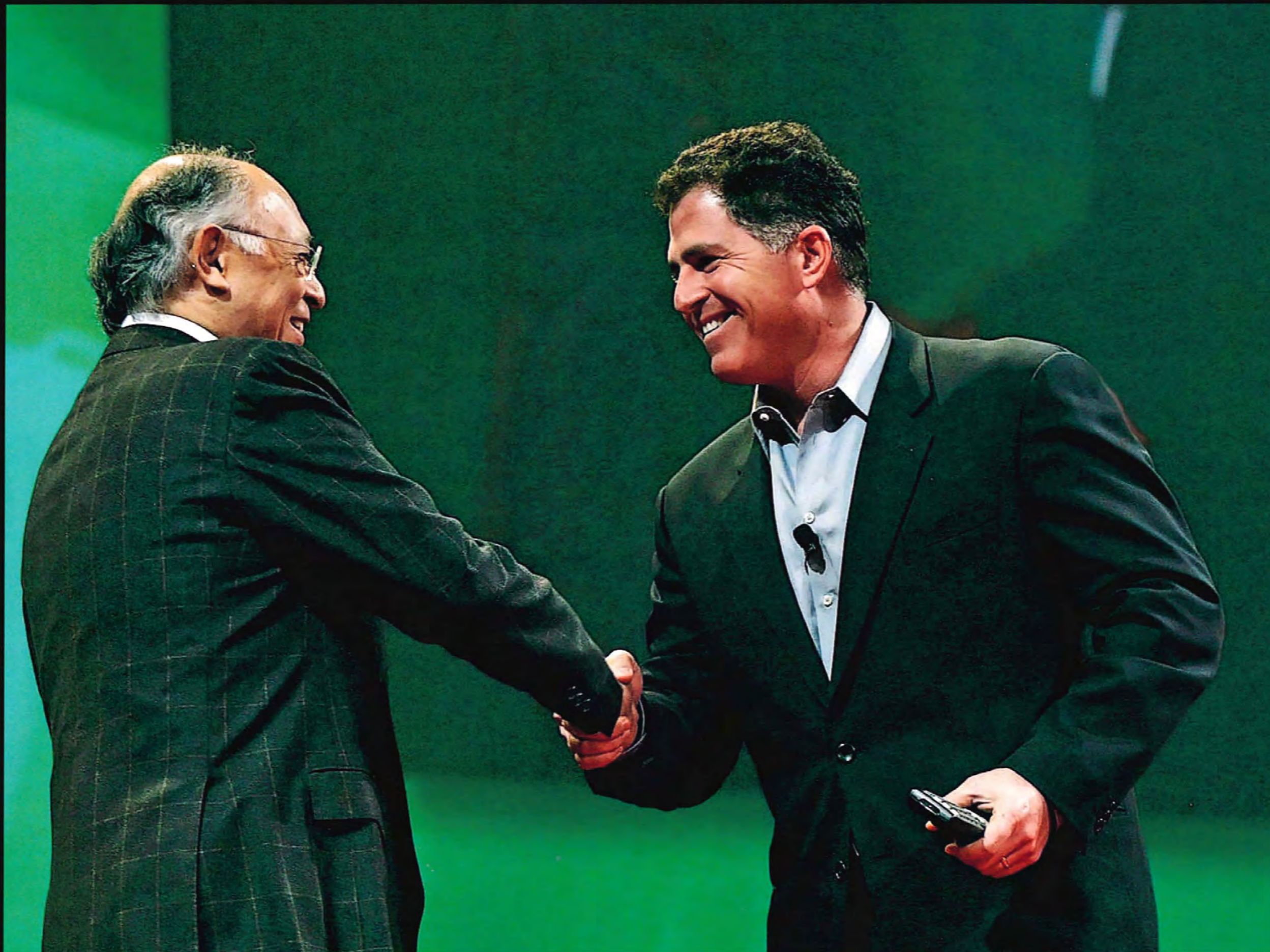
Hector Ruiz and Michael Dell - Oracle Open World October 2006