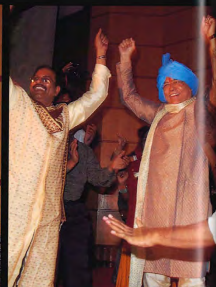
India - November 2007