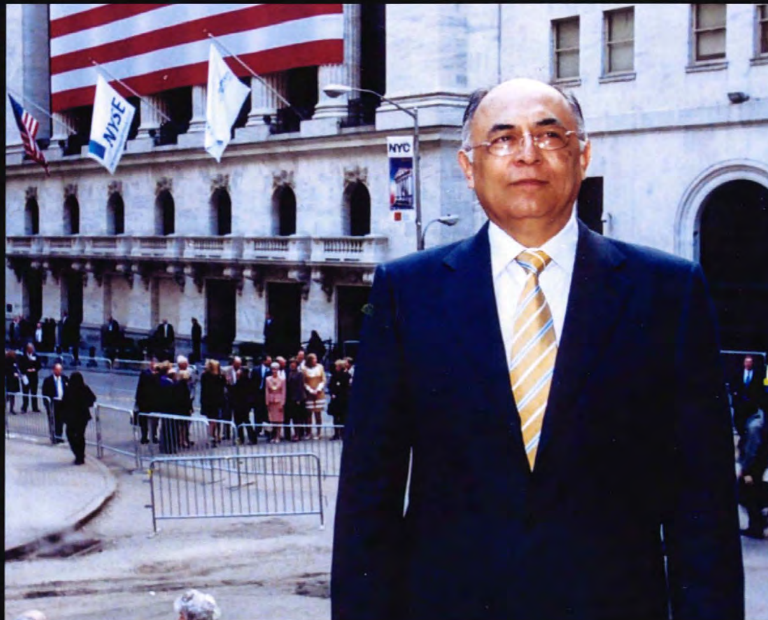
New York Stock Exchange