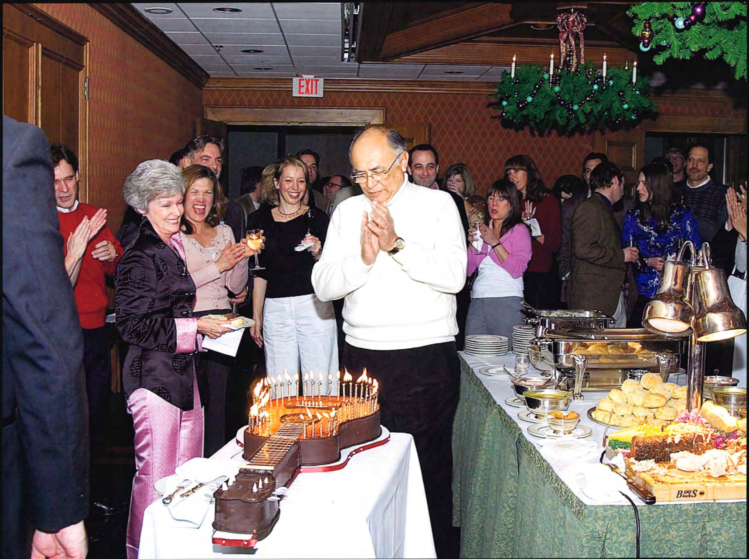
Happy 60th Birthday