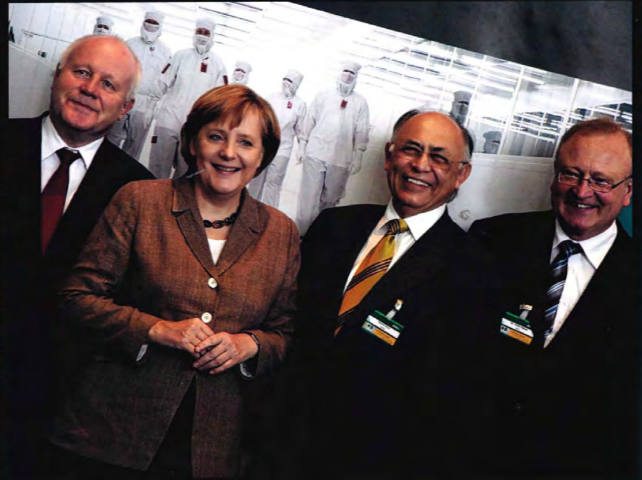
Dresden - October 2006