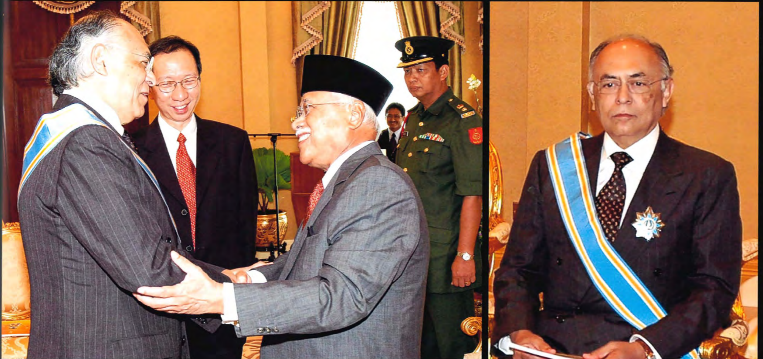
Penang Order of Chivalry Award October 2006