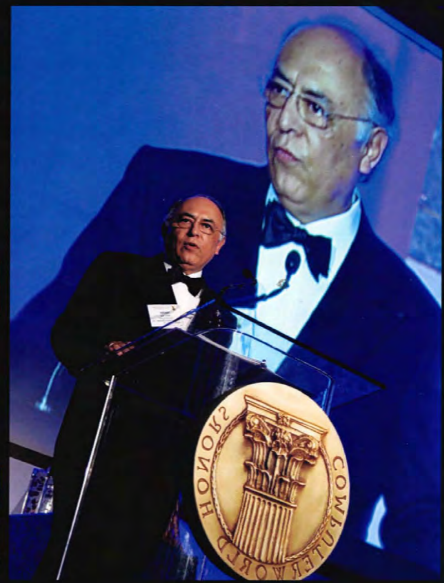
Computer World Honors - June 2006