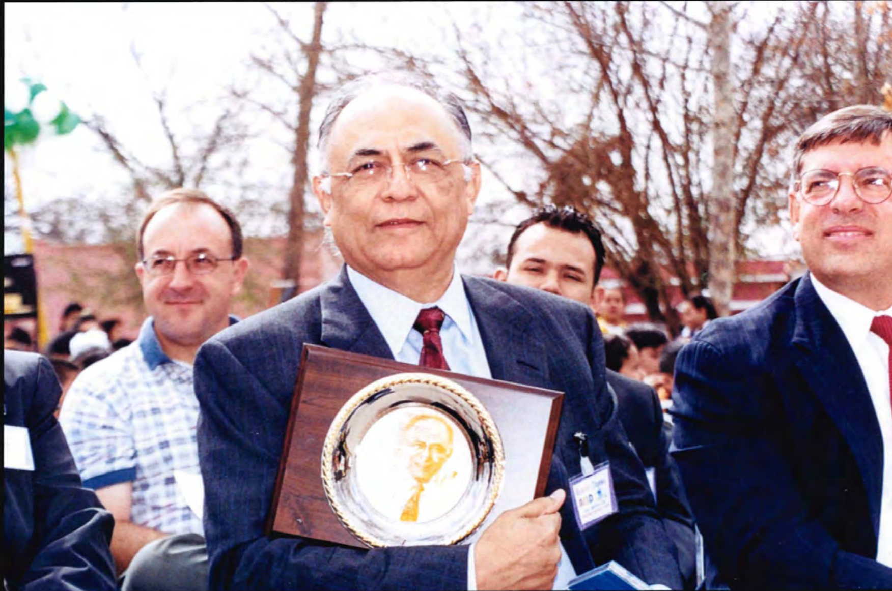
Inauguration Media Lab - Dare to Dream