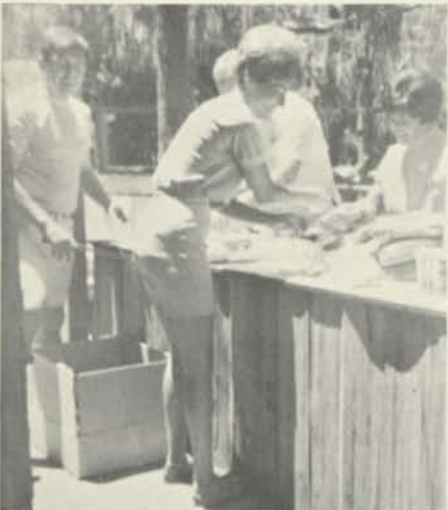
First picnic of the season was Commercial Test and Finish's held at Frontier Village in early June.