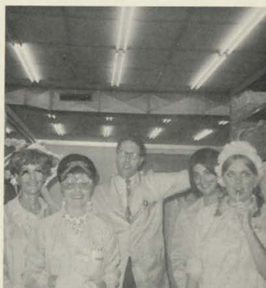
Commercial Test & Finish