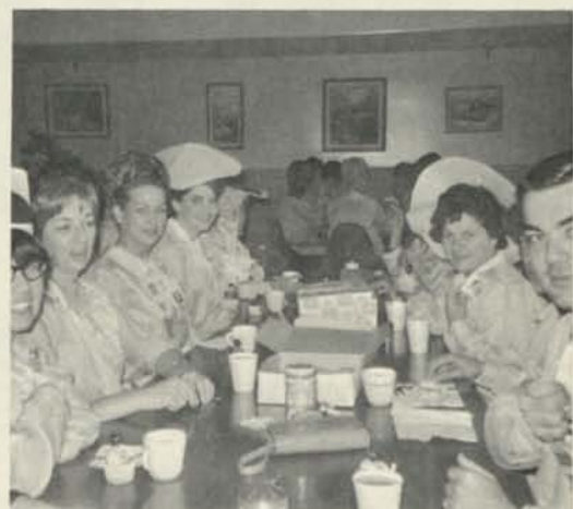
DIC Assembly and Final Seal Swing Shift