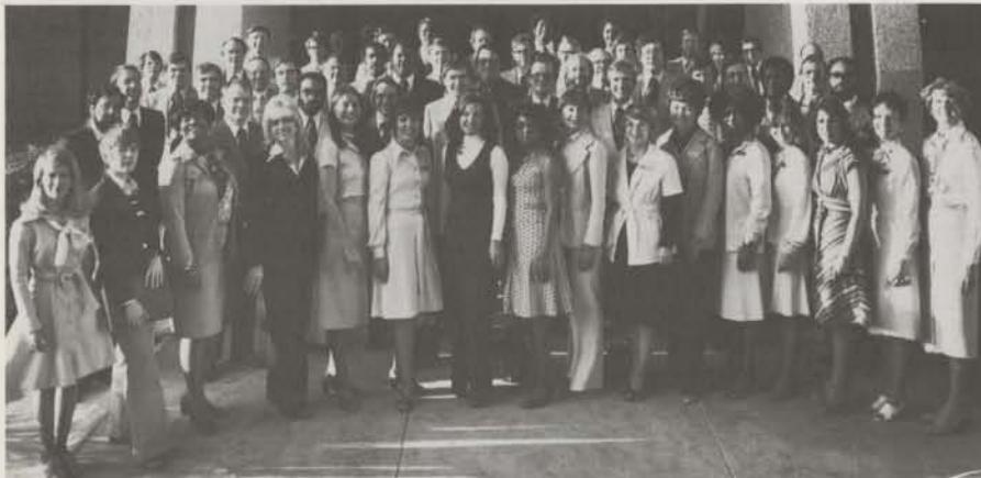
At a recent two-day seminar, people involved in selling in the Federal Government intensified awareness of federal government data processing needs and expanded capabilities for serving U.S. agencies and departments.

Forms located near the end of your current phone book may be used to submit corrections and deletions. Take a moment now to check all information concerning your number, address, name, job and responsibility.