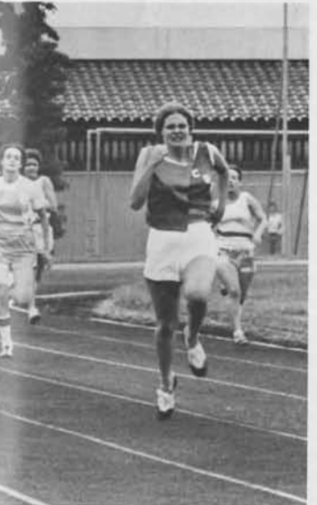
...s for a first-place finish 220 (under 30).