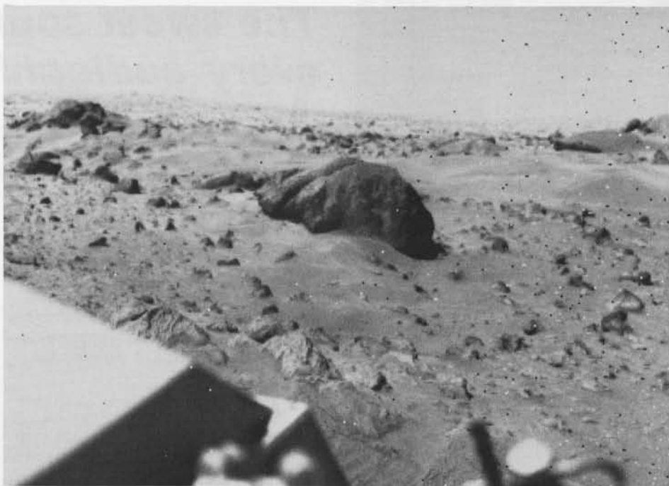
View of the rocky Martian landscape — one of hundreds of photos radioed 220 million miles to earth and seen in newspapers around the world.

For example, scientists may want to look at the Martian landscape as if they were standing beside the Viking lander. The computer, calling up disc-stored photo data, can transform the