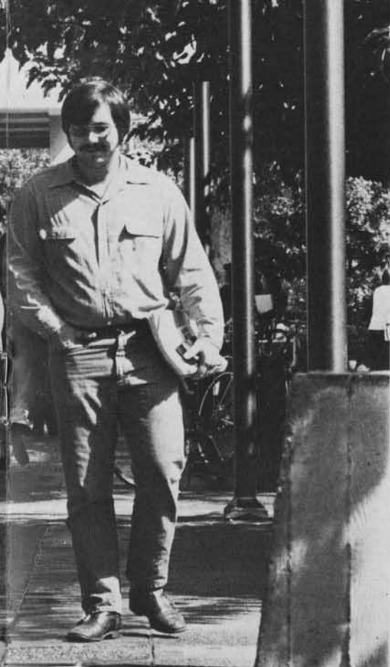
on campus at San Jose State.