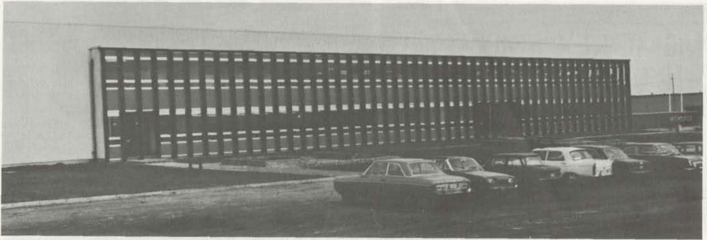
THE BELGIUM PLANT is shown here just after the building was completed, but not yet landscaped. Notice all those "foreign" cars in the picture.