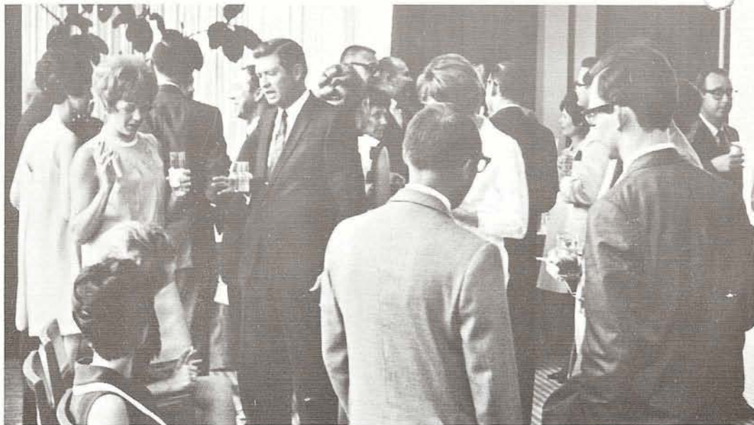
CUC staff enjoying cocktails before dinner