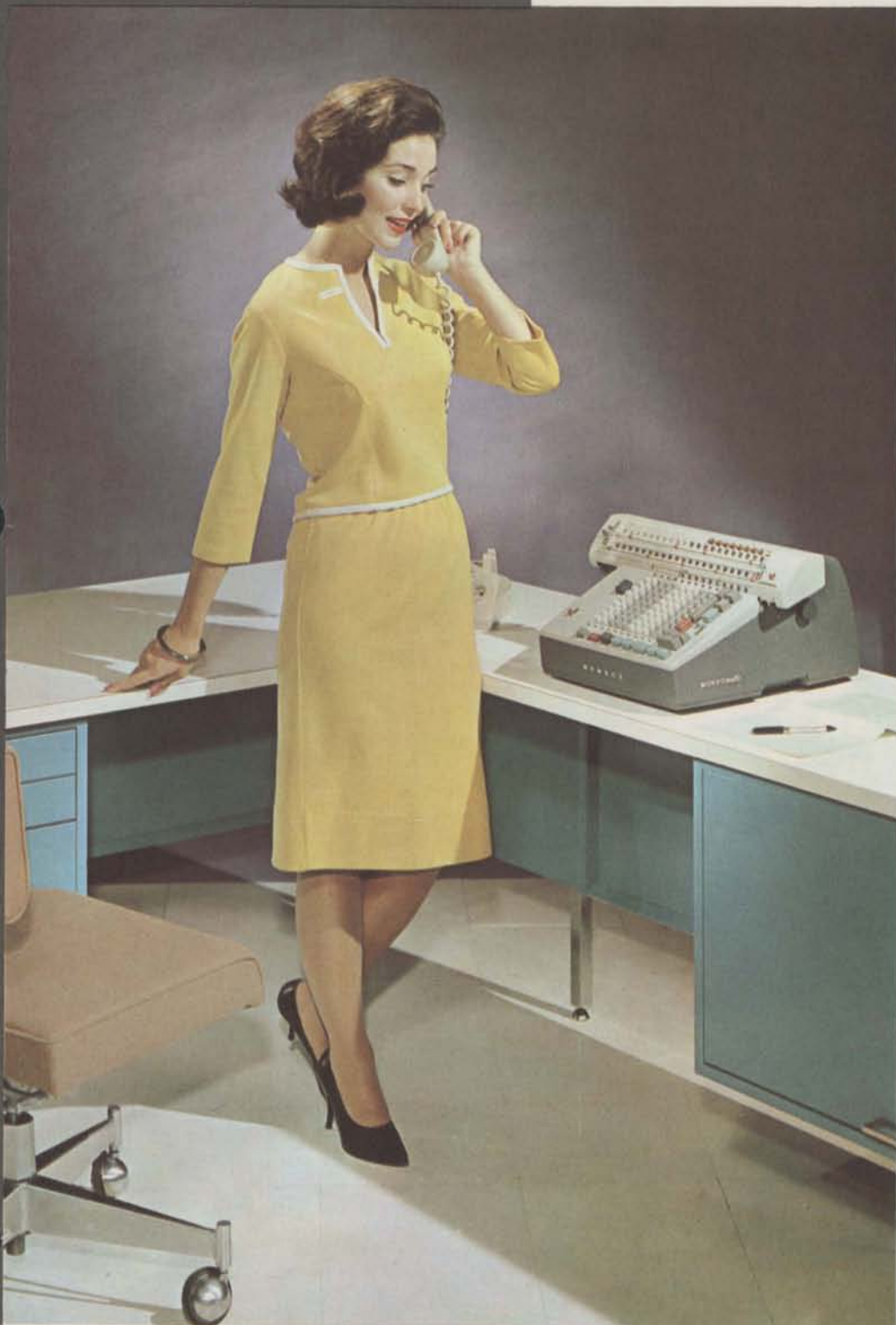
FURNITURE BY COLE STEEL