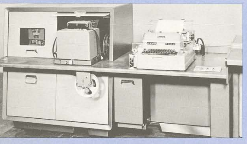
Transac Paper Tape System