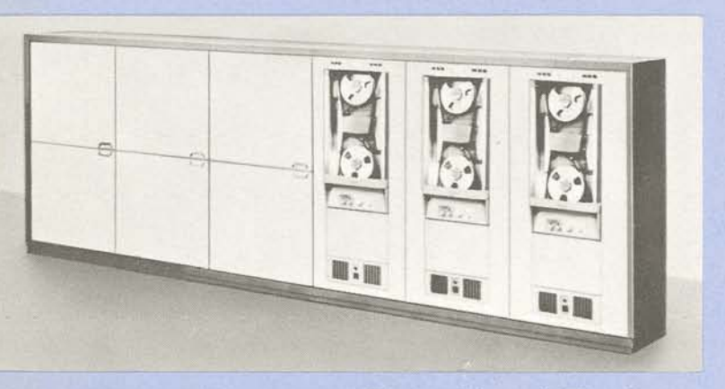
Transac Magnetic Tape System