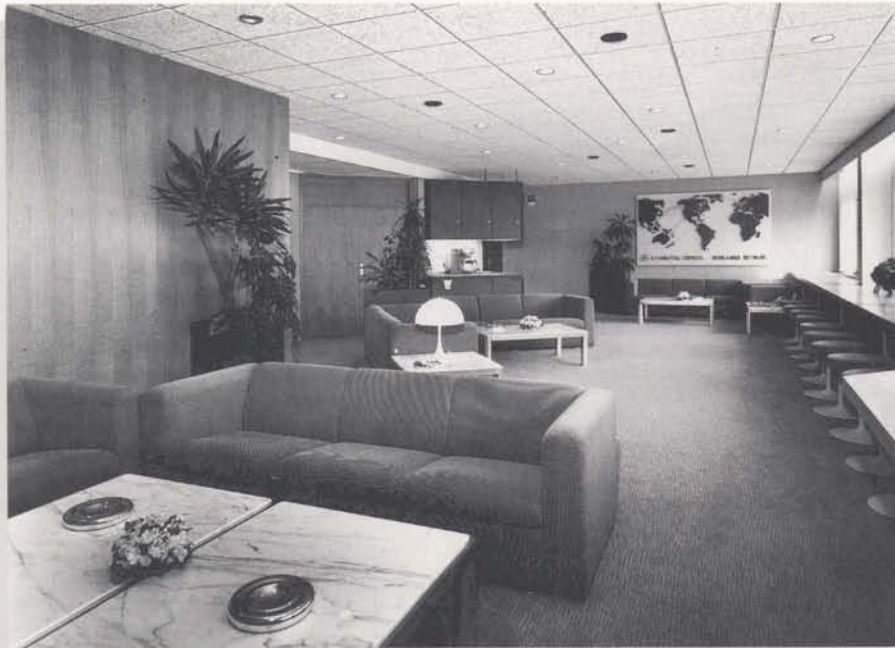
Main Reception Area.