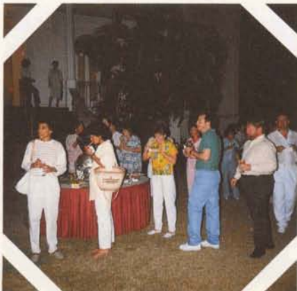
First night reception at Sam Lord's Castle.

from one end of the Island, right to the other. Each Group was given a set of clues to help them find their way along the route. All the clues had to be answered correctly in order to win the Funfari contest, as it was called. Fifty cars set off over a period of an hour and a half and journeyed their way along the tiny roads of Barbados, some finding the answers to the clues, others not caring too much but just generally enjoying the beautiful scenery and the good weather. The end of the Funfari was lunch at a seaside restaurant right on the northern tip of the Island, the opposite end from Sam Lords Castle. Many people felt that the Funfari in itself was perhaps the highspot of the whole Markmakers event, providing as it did, a very relaxed way for the entire Group to take a look at many parts of the Island which they would not otherwise have seen, but to do so in a totally non-touristic way, and at the same time to have fun answering the questions set to help them navigate.