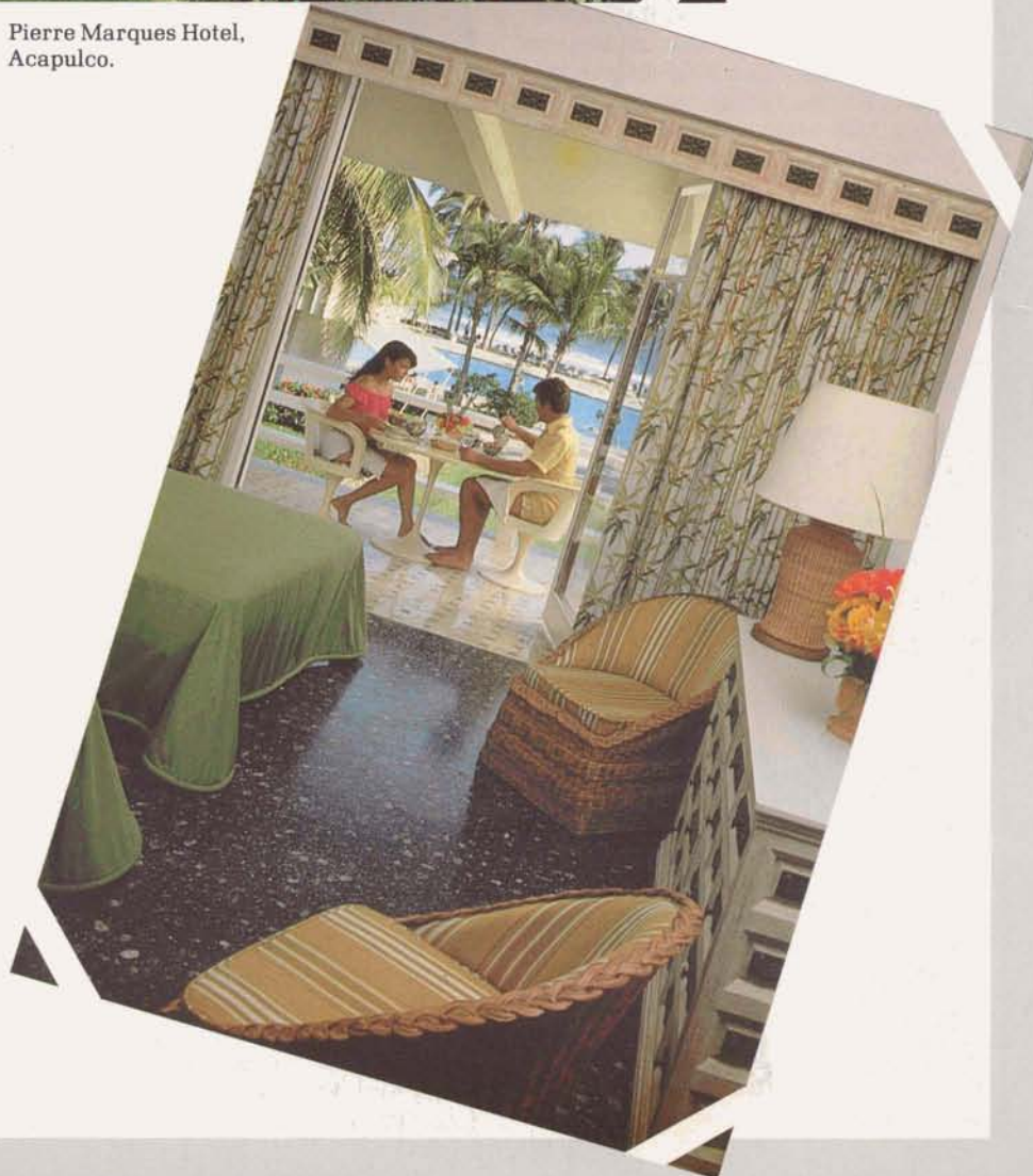
Pierre Marques Hotel, Acapulco.