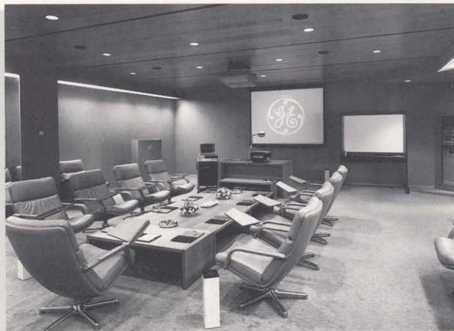
Principal Meeting Room.