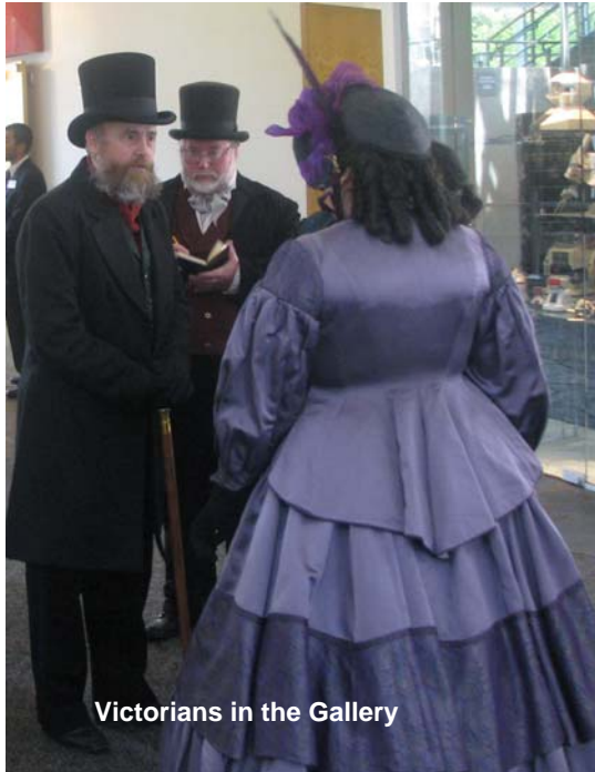
Victorians in the Gallery