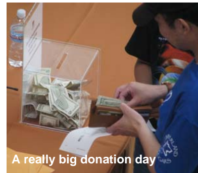
A really big donation day