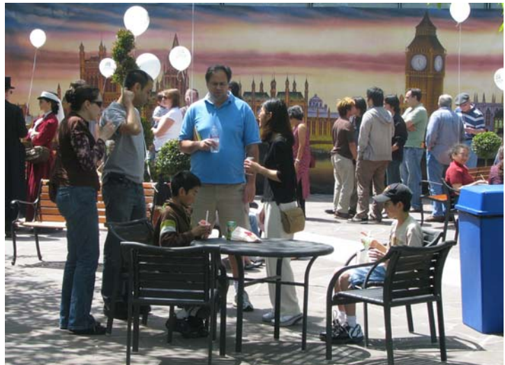
The courtyard patio was magically transformed into a Victorian London park by Valerie Alston of Events.

And the results were outstanding- see our impressive numbers on Page 2!