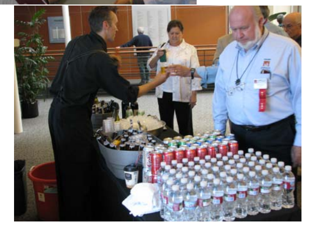
A British-themed bangers & mash dinner, and of course there was beer.