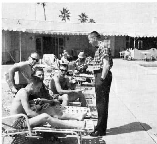
Situated on the sunny coast of Southern California, the luxurious facilities of the Hotel Del Coronado are exceeded only by its climate. Swimming, sailing, golf, and fishing were enjoyed by all hands at the sales conference. And the legendary Mexican border town of Tijuana with its roaring night life was only minutes away.