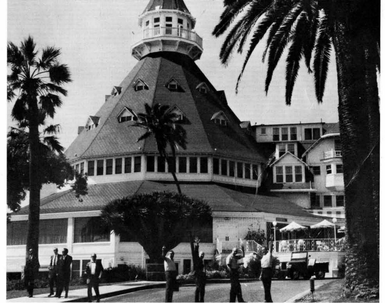
FAR LEFT —Work sessions, conducted by members of Fairchild Semiconductor marketing and engineering staff, were held at Hotel Del Coronado, San Diego, California.