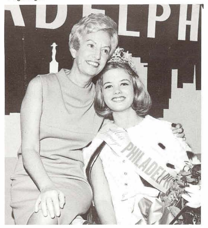
Reprinted from Wall Street Journal