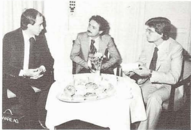
Munich, Germany: Morning break between sessions