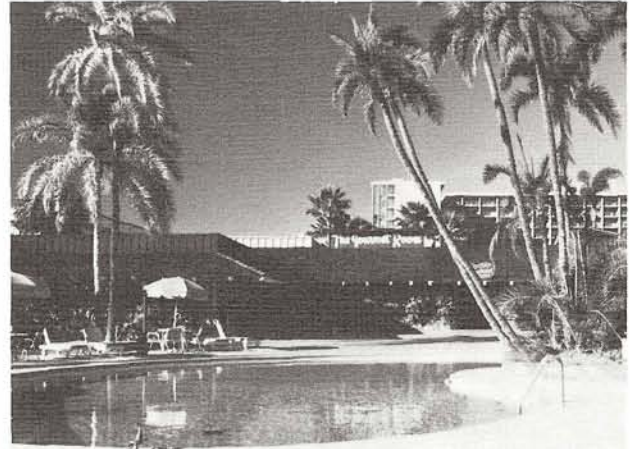
San Diego, California: Town and Country Hotel and Convention Center; palm trees and one of four swimming pools

The Second International Com-plete Users' Conference will be held June 11th and 12th, 1979 in San Diego, California preceding the Seventh ADABAS Users' Conference. The convention headquarters will be the Town and Country Hotel in San Diego's Mission Valley area.