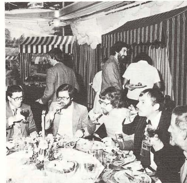
Munich, Germany: Bavarian Evening toast to ADAGROUP