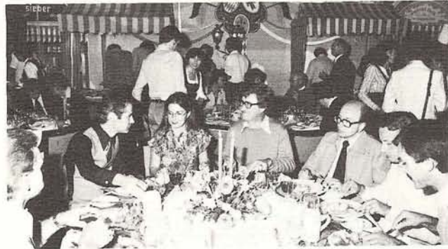
Munich, Germany: Bavarian Evening banquet

Director of Education Services Data Logic Division Computel Systems, Ltd. 130 Slater Street Ottawa, Ontario K1B 3Y4