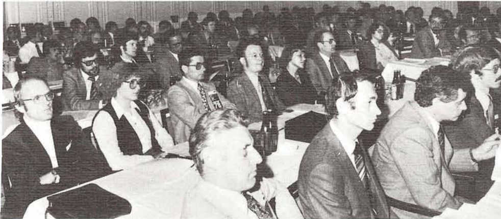
Munich, Germany: General session of the Sixth International ADABAS Users' Group Conference

6. INTERNATIONAL ADABAS USERS CONFERENCE