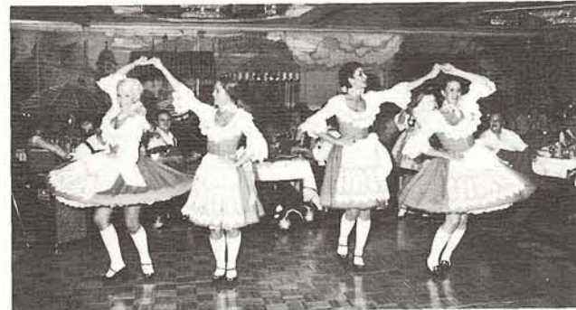
Munich, Germany: Bavarian Evening entertainment