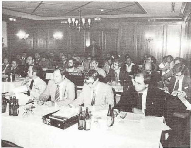
Munich, Germany: Breakout session at Sixth ADABAS Users' Conference