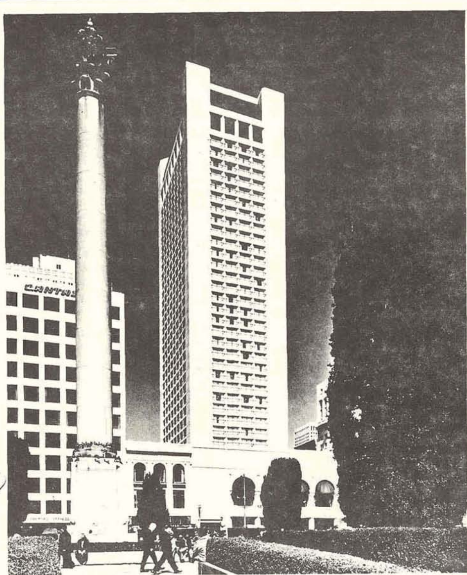
Hyatt on Union Square, San Francisco