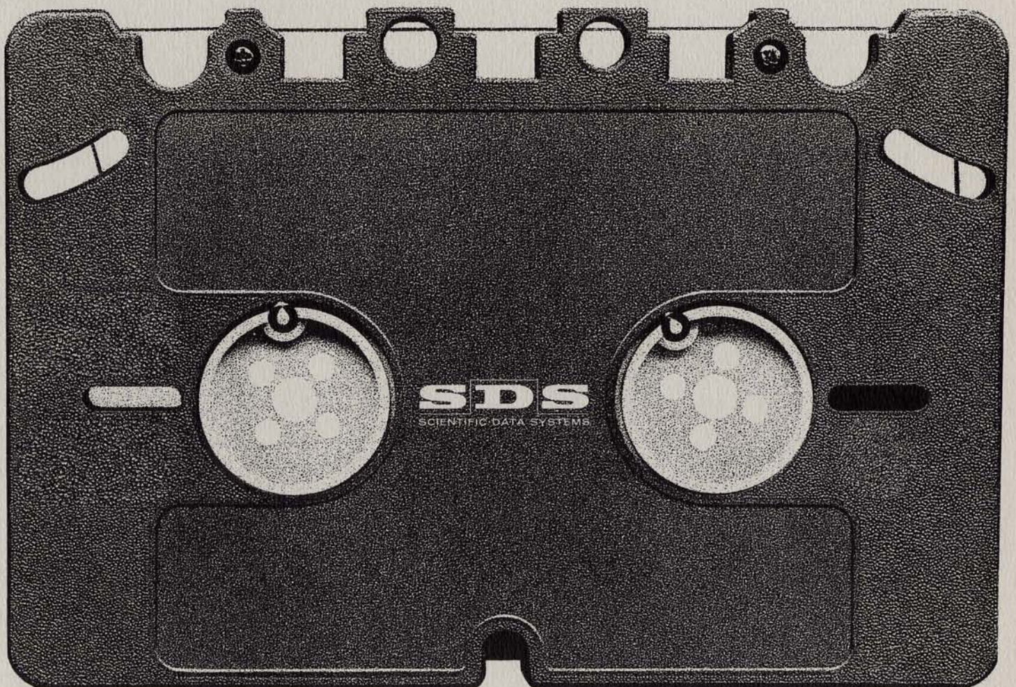
Actual size of tape cartridge

Unless digital equipment costs are of no consequence to you and your firm, this folder contains a major announcement.