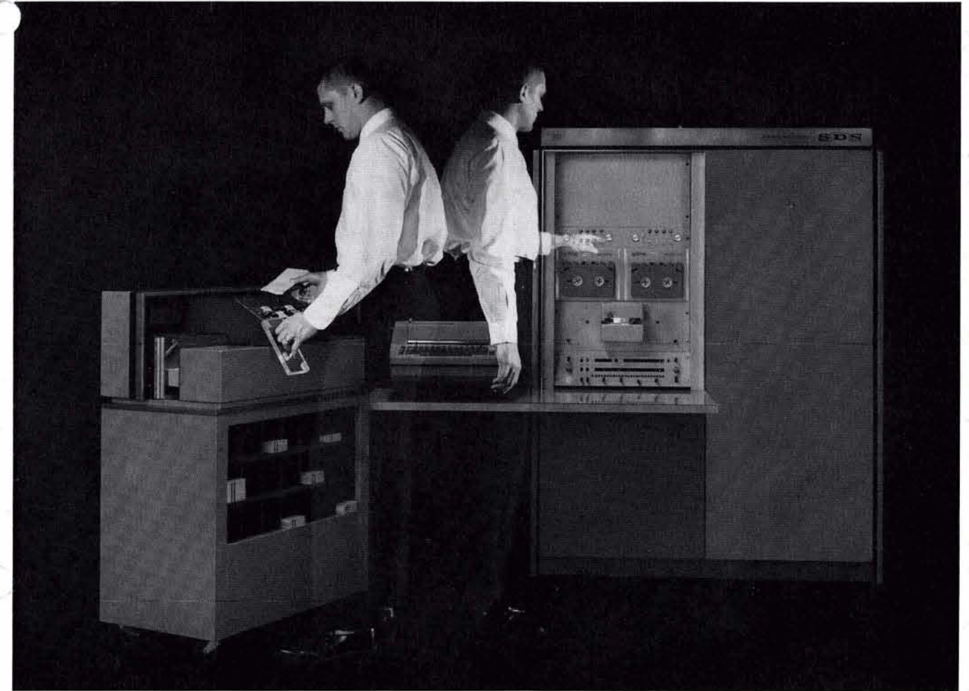
WITH MAGPAK To assemble a program