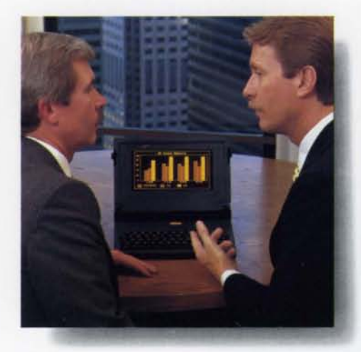
Whether your application is sales, engineering, auditing, government, banking or consulting, GRiD's big, easy to read screen is perfect for client presentations.